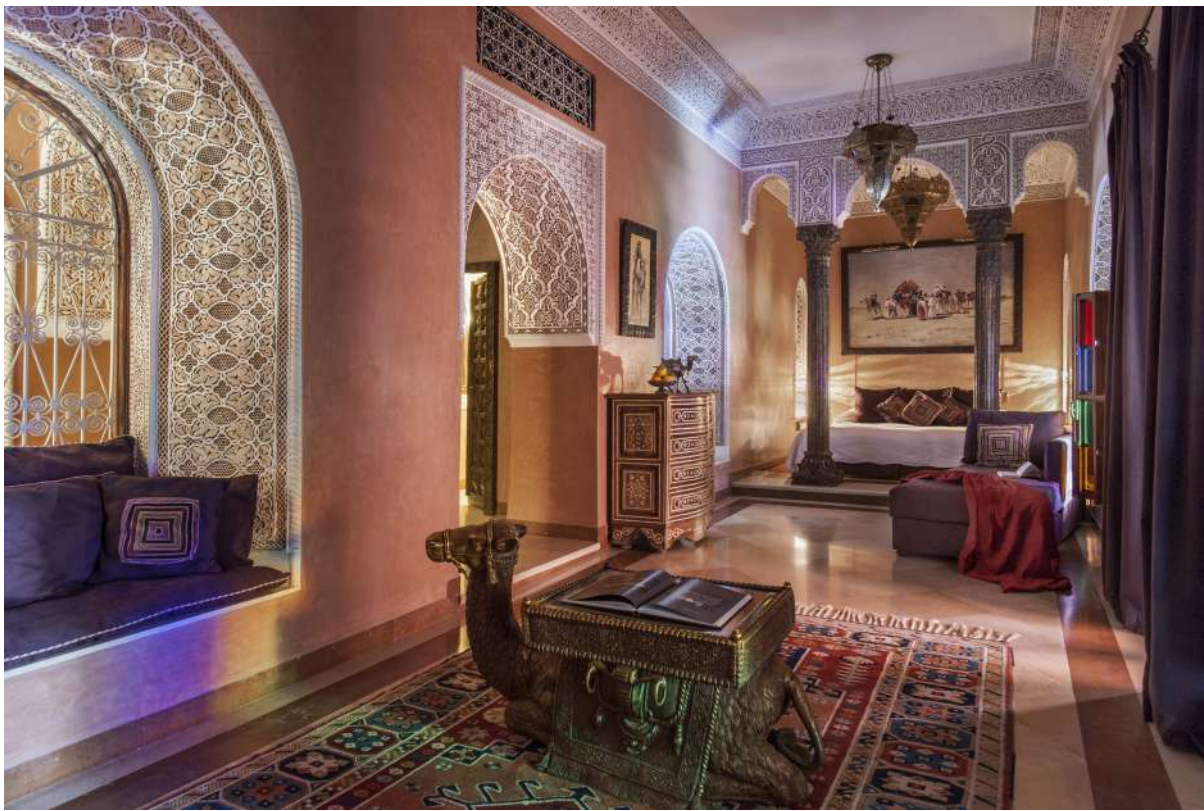
La Sultana Marrakech is a boutique, luxury hotel and a hidden gem of quintessential Moroccan charm and glamour within the old Imperial City Walls. Flowered patios with palms, sica and banana trees make La Sultana an oasis of calm away from the hustle and bustle of the Kasbah.